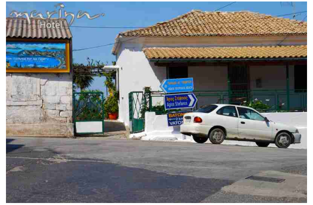
Drive for 1,4 Km get to point 8,here make a right turn