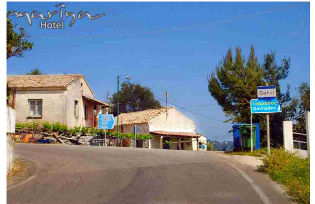
Drive for 2.9 Km to point 10,here make a left turn