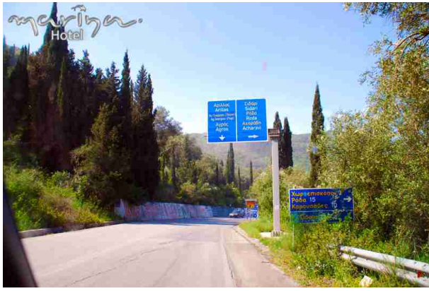
Drive for 9 Km and get to point 7,continue straight