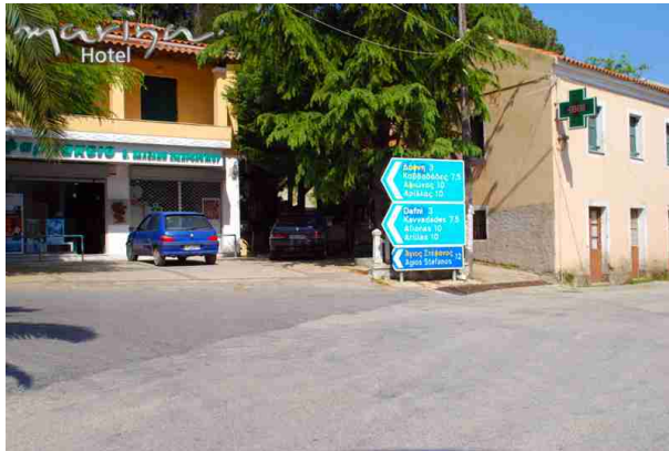
Drive for 1,3 Km to point 9,here make a left turn