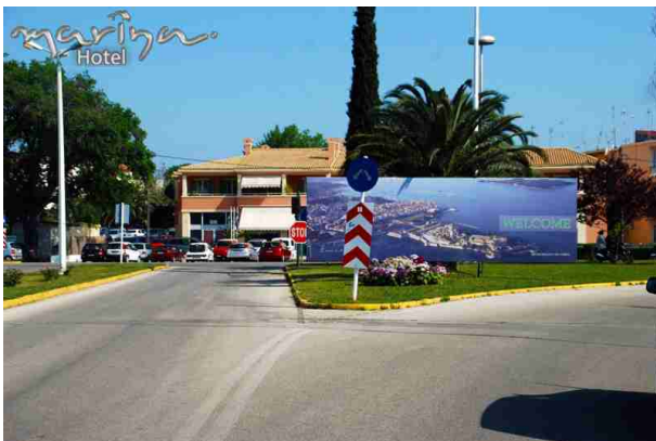
Drive for 0.6 Km till you get to point 1, here make a right turn